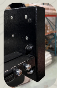
5. Mount shower

PLEASE DON'T HESITATE TO CONTACT US IF YOU NEED ANY SUPPORT REGARDING THE FITMENT. THANK YOU FOR YOUR SUPPORT. WE HOPE YOU LOVE YOUR QUICK PITCH PRODUCT.