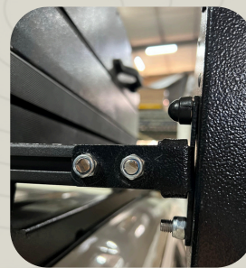
3. Tighten bracket